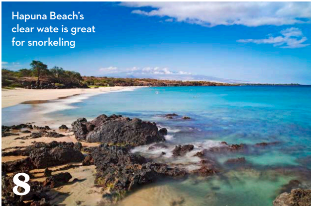
Hapuna Beach's clear water is great for snorkeling

Museum; kids can explore the teddy-bear hospital and lighthouse ($7 per person, kids age 1 and under are free). Then check out the Wright Brothers National Memorial in nearby Kill Devil Hills. There are kite-flying demos and Junior Ranger programs.