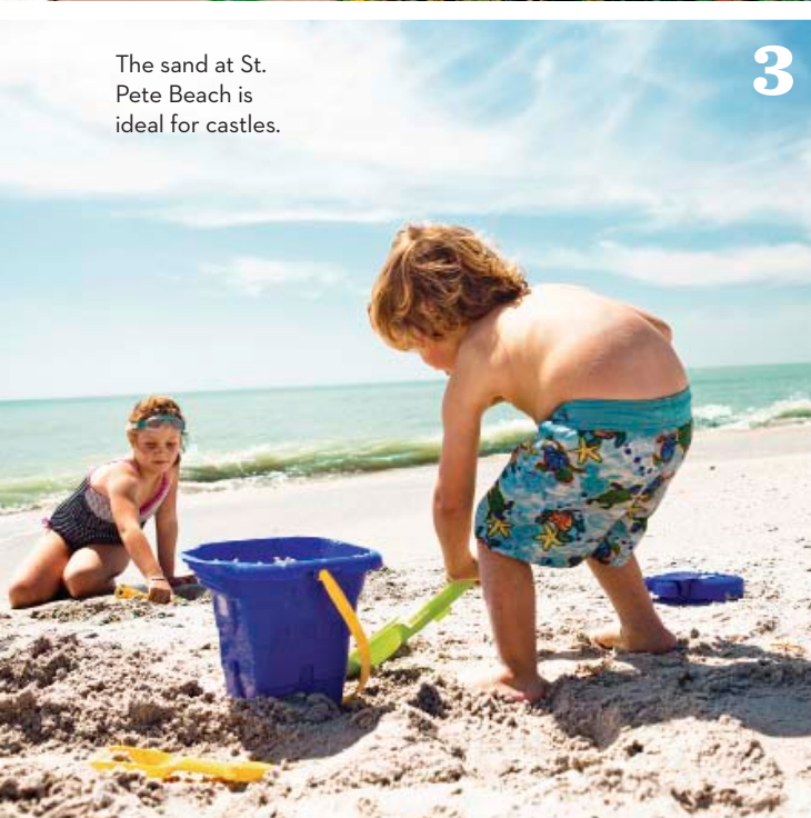
The sand at St. Pete Beach is ideal for castles.

* Inland Hot Spots The Dali Museum's treasure hunts, stories, and craft projects occupy the kids so you can appreciate the