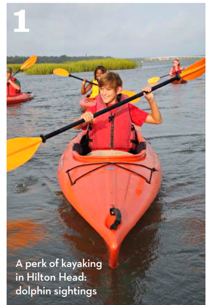
A perk of kayaking in Hilton Head: dolphin sightings

treatments, such as bamboo massage. (Rooms with two queen beds start at $169 per night; omnihotels.com.) If you're torn between staying at a resort or a renting a house, consider a villa at Disney's Hilton Head Island Resort, also in Palmetto Dunes. Each villa has a full kitchen, separate sleeping area for the kids, and many