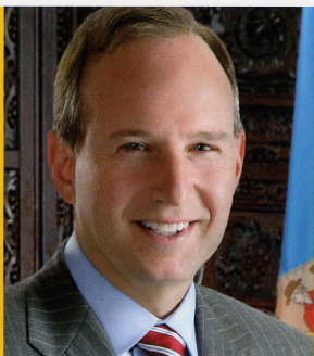
Jack Markell Governor State of Delaware

“My administration is committed to make Delaware more responsive to business' needs. Small businesses often have trouble accessing the capital they need to grow and create jobs. My LIFT program supports Delaware businesses with sound plans for success.”