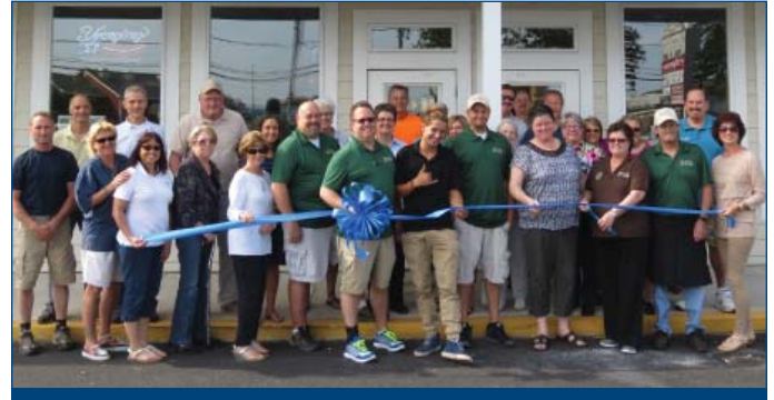
Murph's Beef & Ale