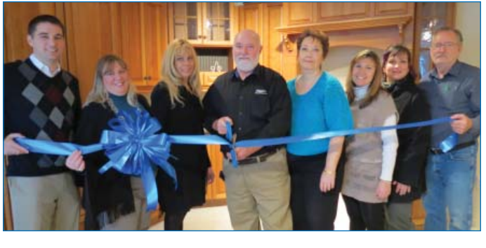
Phippin's Cabinetry & Renovations