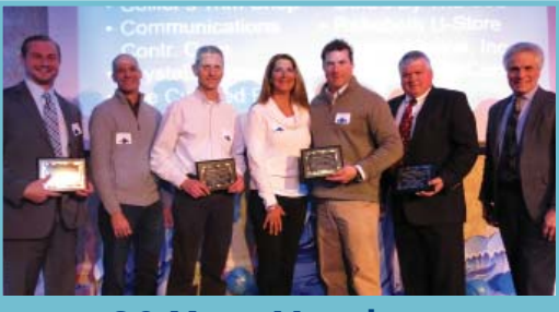
20 Year Members