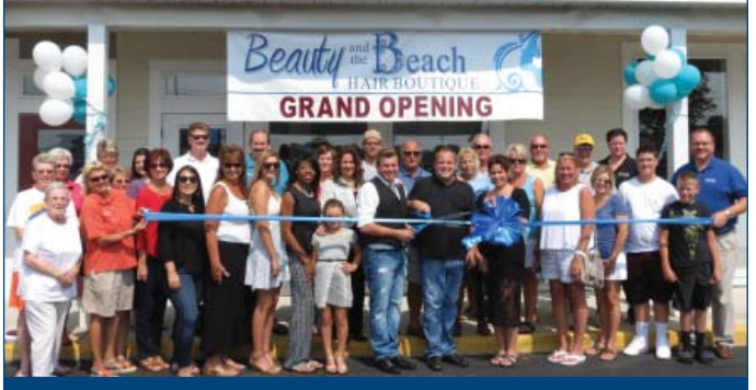
Beauty and the Beach Hair Boutique