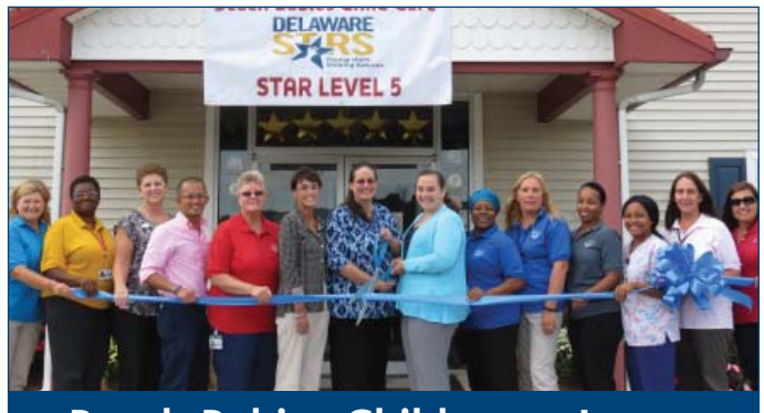
Beach Babies Childcare - Lewes