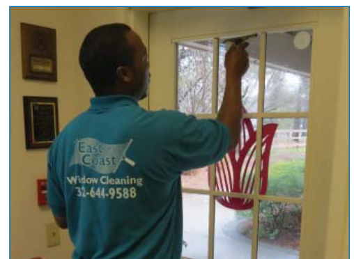
East Coast Window Cleaning