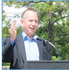
Governor Jack Markell