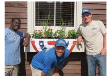
East Coast Garden Center

With the help of our Members, the Visitors Center and Chamber of Commerce have been sprucing up!