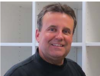
The Closet Works