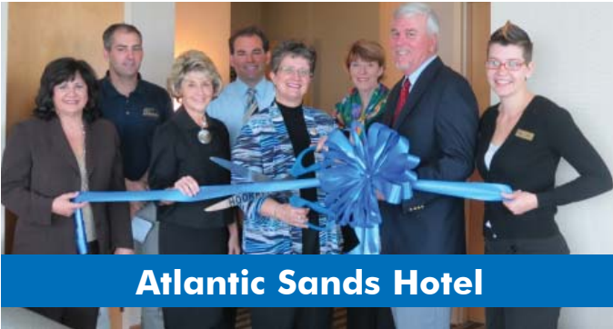
Atlantic Sands Hotel