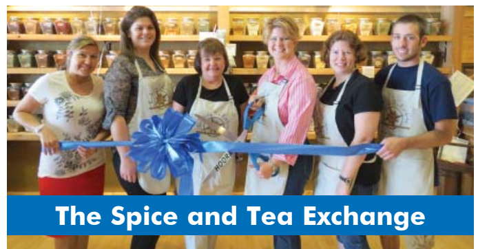
The Spice and Tea Exchange