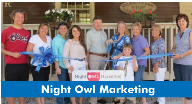
Night Owl Marketing