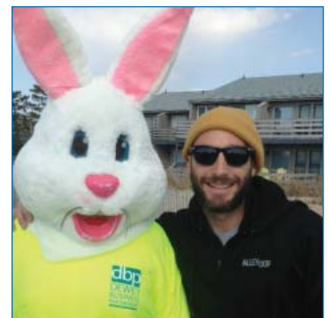
Alley Oop Egg Scoop