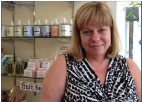
Little Egg Harbor Soap