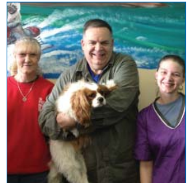
Doggies at the Beach