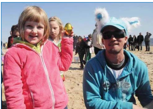
Alley Oop Egg Scoop