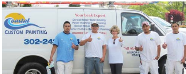
Coastal Custom Painting