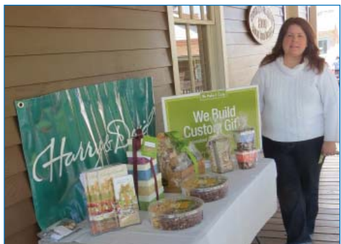
Harry & David