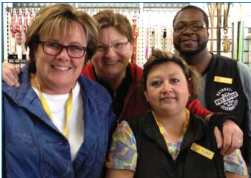
DJ's Pet Depot