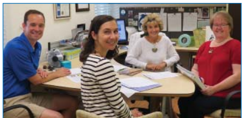
Int'l Student Program Meeting