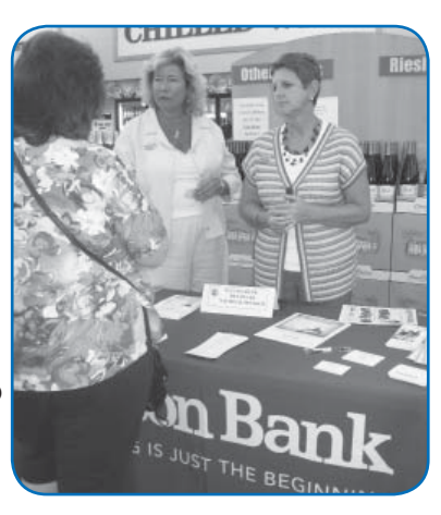
2011 Trade Show Participants

Trade Show will be held on Wednesday, May 23rd at the Atlantic Sands Hotel Swan Ballroom. The cost per table is $65.00. For more details and to reserve your spot, contact Kate at events@beach-fun.com or 302-227-2233 ext. 11.