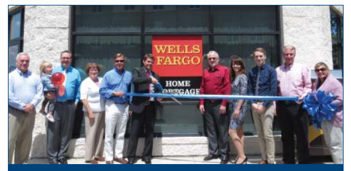
Wells Fargo Home Mortgage