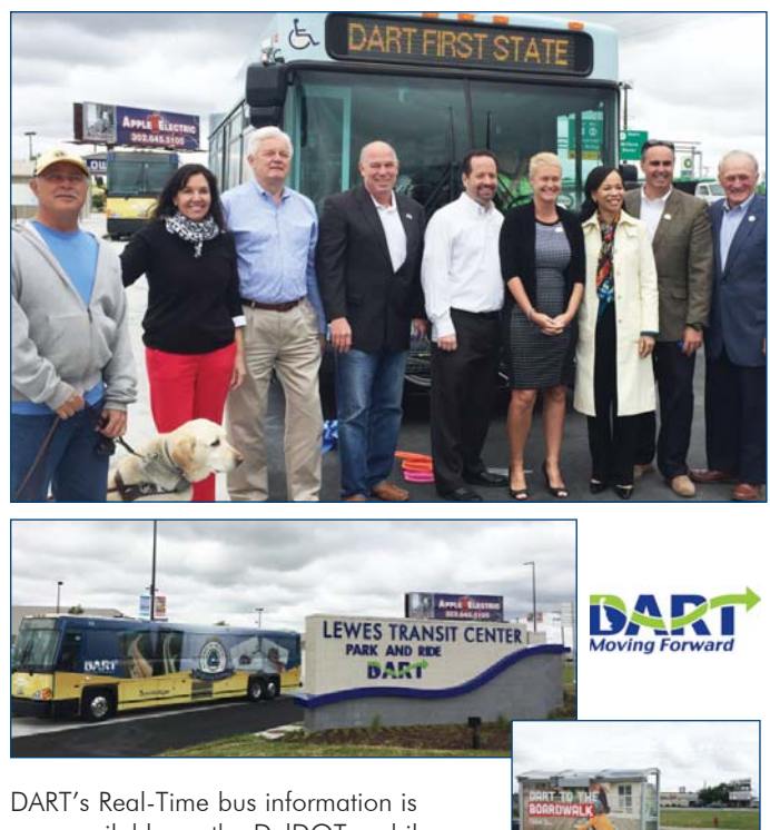
now available on the DelDOT mobile app. Riders can select any bus stop and receive bus arrival times and live updates to plan their trip right down to the minute.

The Delaware Transit Corporation, a subsidiary of the Delaware Department of Transportation (DelDOT), operates DART First State. For information on fixed route bus services statewide, please call 1-800-652-DART or visit www.DartFirstState.com.