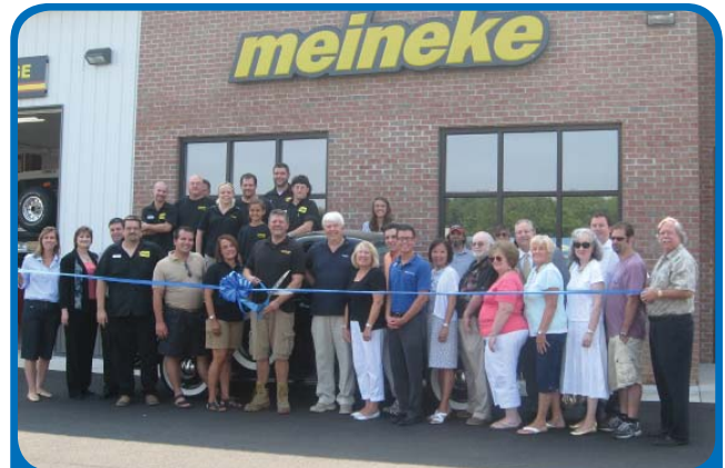
Lewes Meineke Center