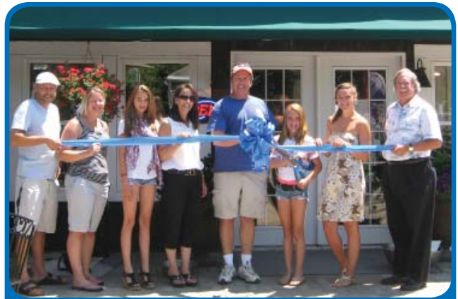
McKenzie Fae Accessories