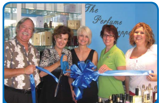
The Perfume Shoppe