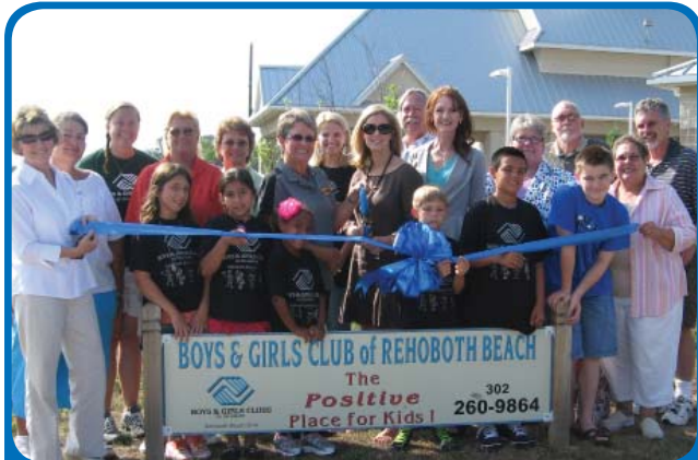
RB Boys & Girls Club