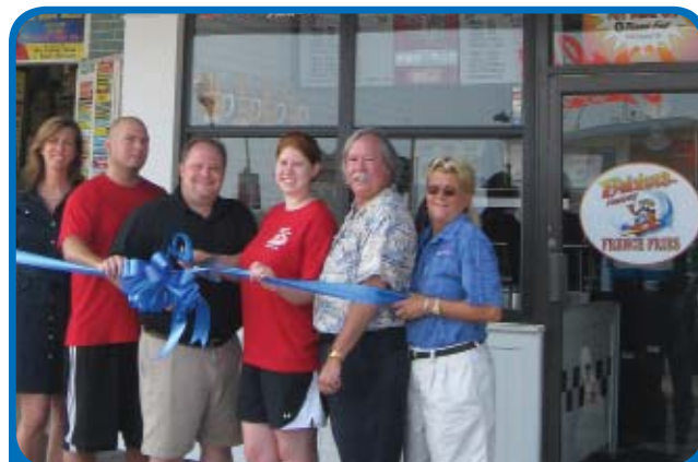
Brickers Famous French Fries