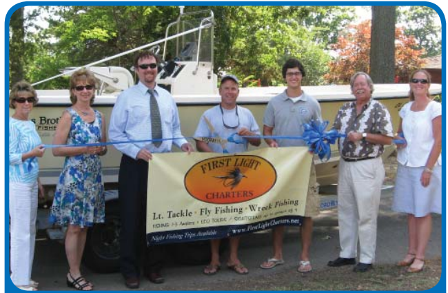
First Light Charters