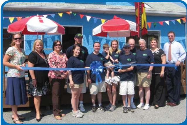
Dewey Beach Bull