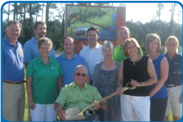
The Peninsula-Nature Ctr.