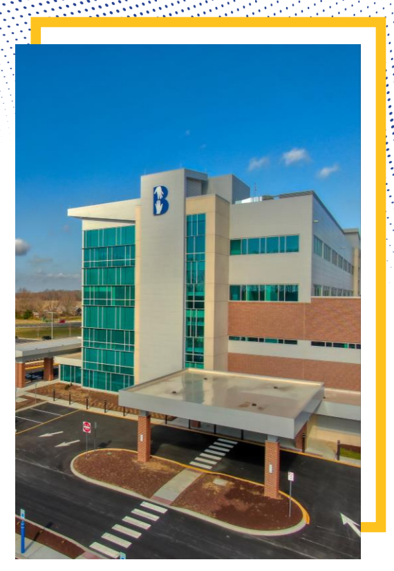
Specialty Surgical Hospital at Rehoboth Health Campus