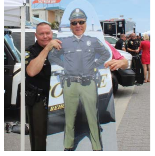
June E-Newsletter · 2019