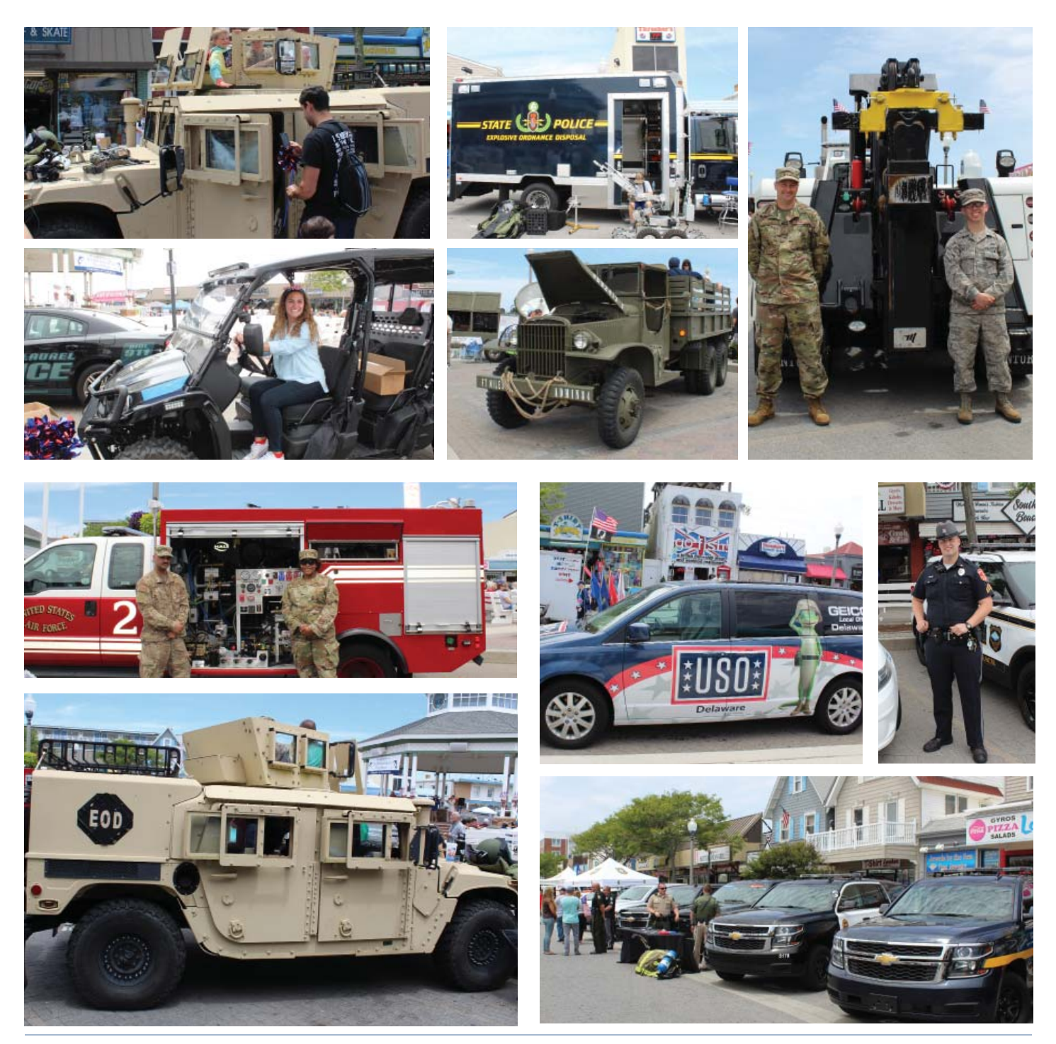
16 Rehoboth Beach-Dewey Beach Chamber of Commerce & Visitors Center

The Rehoboth Beach - Dewey Beach Chamber of Commerce cannot give enough thanks to our First Responders and those who assisted in growing this event and making it a great success! From the Army helicopter flyover, Coast Guard "Float By", USO Delaware, Fort Miles, VFW, Veterans United Outreach, Rehoboth Beach Museum & Historical Society, State Police, Paramedics, Rehoboth Beach Fire Department, Rehoboth Beach Police Department and other local police departments.