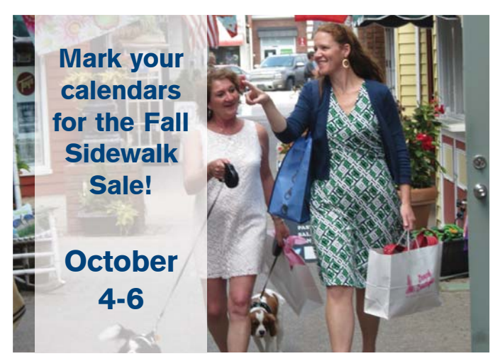
June E-Newsletter · 2019

For more info, visit sdelaware-salisbury.mosquitojoe.com or call 302-425-9295. 🔶