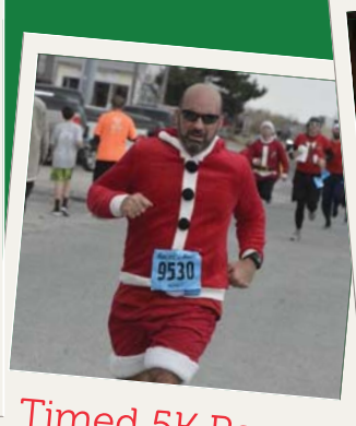
Timed 5K Race