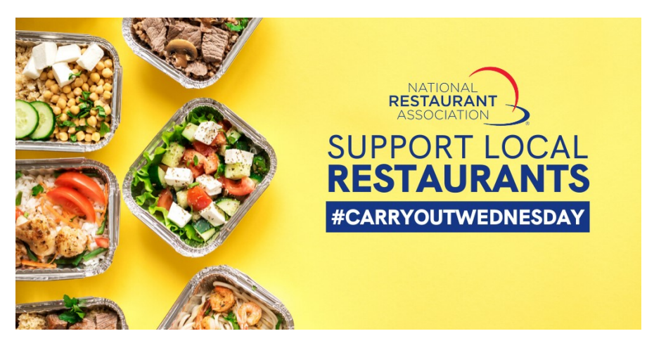
We are ready to promote all that you do!

This promotion will be nationwide and is being coordinated by the National Restaurant Association and local/state restaurant associations.