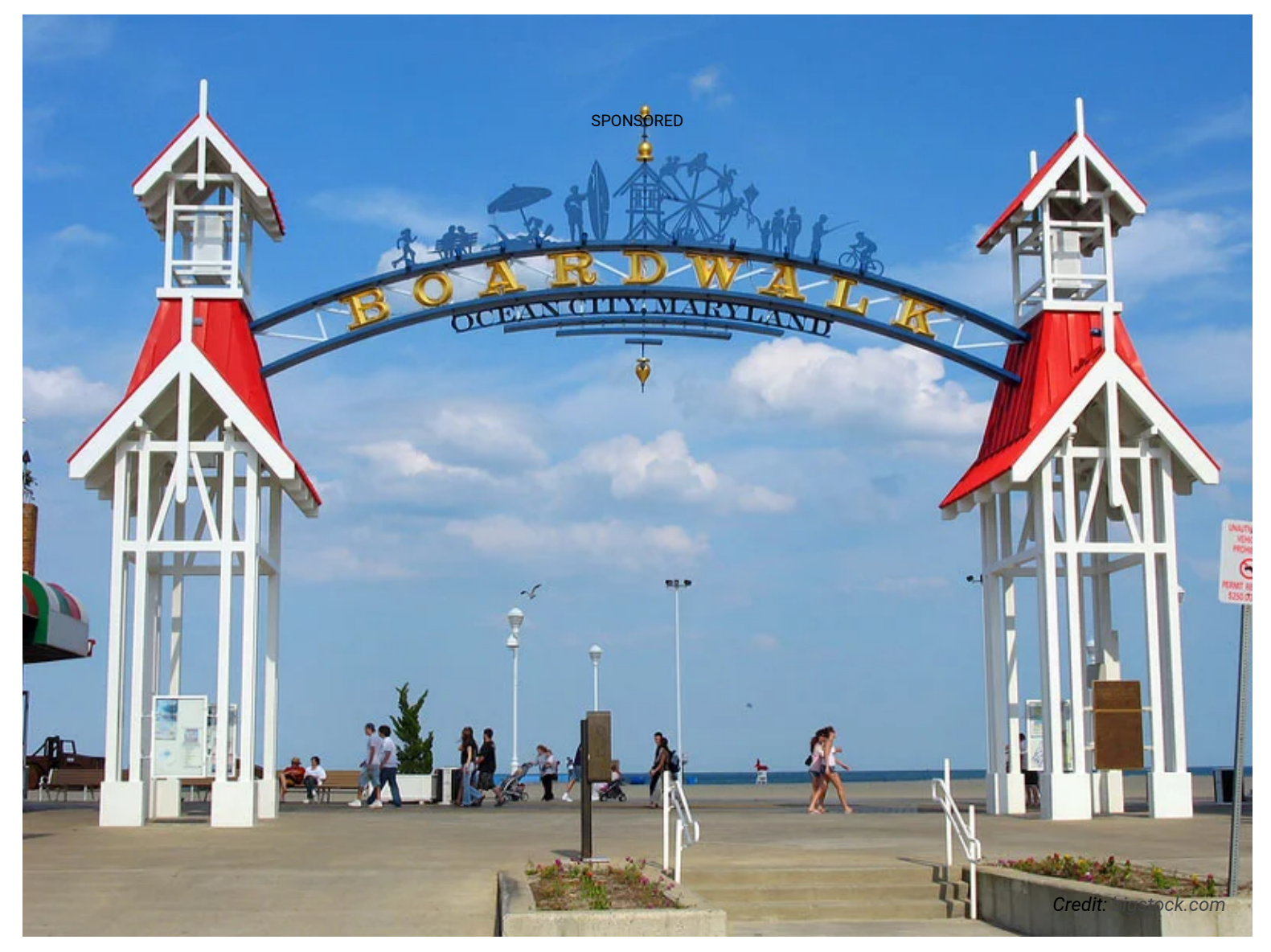
Ocean City, Maryland