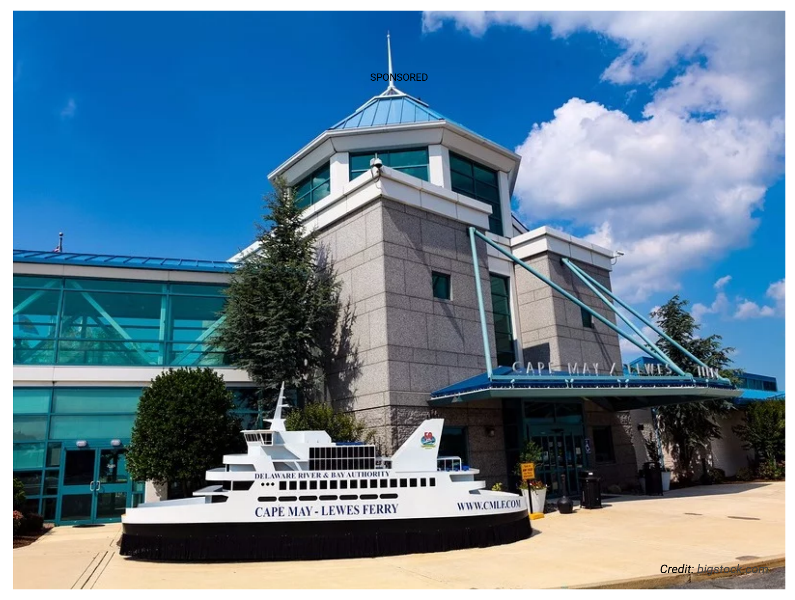
Lewes Ferry terminal in Lewes