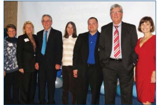
Dirty Job Crew Volunteers