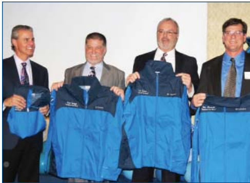
10+ Board Service