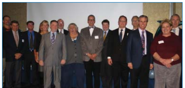
2015 Board of Directors