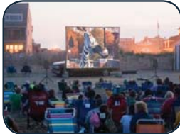
Dewey Beach Movies & Bonfires June 13-August 31