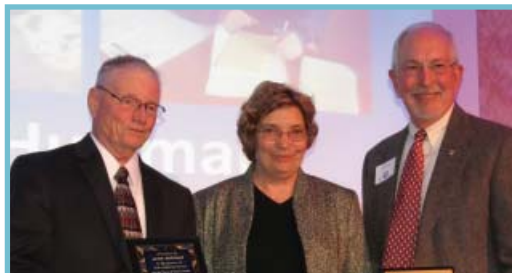
Town of Dewey Beach