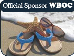
Beach Goes Blue New Event! June 4

MULTIPLE CHAMBER EVENTS IN 2016 . . . ONE SPONSORSHIP PRICE!