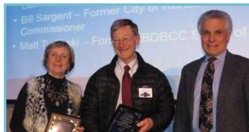
Individual Service Awards