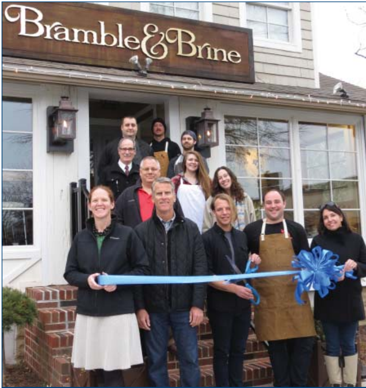
Bramble & Brine