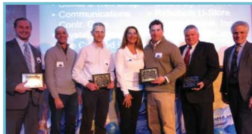
20 Year Members