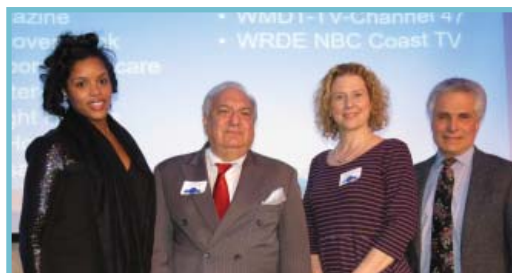
Sponsors - $3,000 & Up