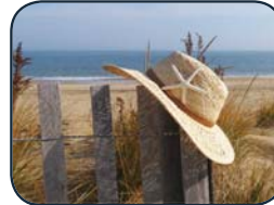
Spring & Fall Sidewalk Sales May 20-22, October 7-9