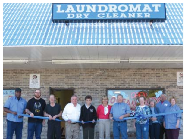
Ocean Suds - Long Neck