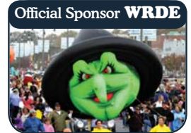
Sea Witch Festival® October 28-30