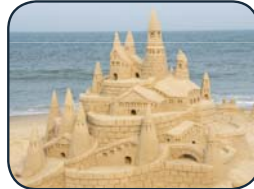
Sandcastle Contest New Date! September 10