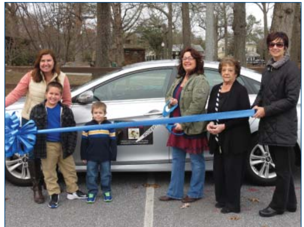
Person 4 You