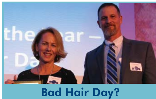
Bad Hair Day?